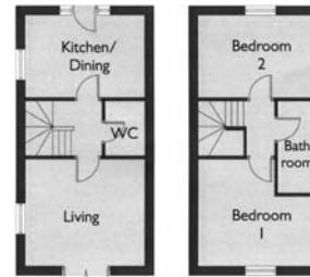
Ground Floor French doors onto patio area and courtyard.