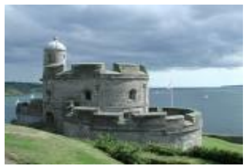
St Mawes Castle