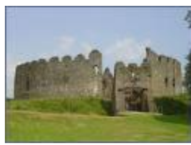
Restormel Castle - Lostwithiel

Fowey (18 miles) - Fowey (pronounced Foy) is situated on one side of the Fowey River estuary with Polruan on the other (which can be reached by passenger ferry). During high tides boat trips run from the town quay. Yachts and Dinghies crowd the estuary in the summer and from the docks, which lie upriver, China Clay is exported. There are two local festivals, the first is an arts and literature festival celebrating the life of it's most famous resident Daphne Du Maurier, which runs during May www.dumaurier.org and the second is Fowey Regatta Week which is the village carnival week and takes place at the end of August – www.foweyregatta.co.uk Upon arrival it is recommended that you park in the main car park as it can get very congested in the town, although this does mean an uphill walk when you return to your car!