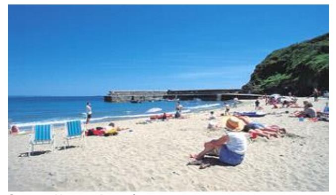
Gorran Haven Beach