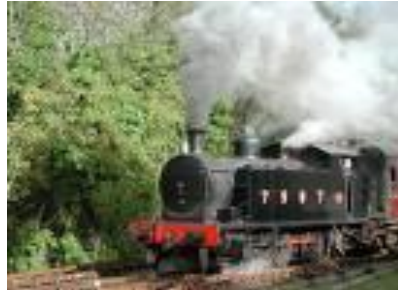
Bodmin Steam Railway