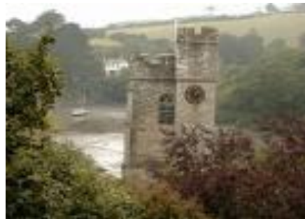
St Just in Roseland

St Mawes (14 Miles) - St Mawes is situated at the southern end of the Roseland Peninsula. An important port in medieval times, and now a characterful and chic coastal village and yacht haven, it is protected by the most perfectly preserved of Henry VIII's coastal fortresses. St. Mawes Castle was built in the 16th century to counter the invasion threat from Europe in partnership with its twin, Pendennis, on the other side of the Fal Estuary. There is a regular pedestrian ferry service to and from Falmouth, as well as a small seasonal passenger ferry with a regular service throughout the day between St Mawes and Place, offering an opportunity to explore the beautiful St Anthony Head and enjoy circular walks in the area.