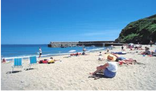
Gorran Haven Beach