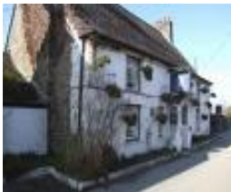
The Crown Inn, St Ewe

Pentewan (6 miles) - The village has a pub with beer garden, restaurant, tearoom, gift & general shop and water sports shop which also supplies diving air. The local Post Office is located in the Petrol Station. The village is dominated by the old harbour, built between 1818 and 1826, which has been silted up since the 1940's. The beach can be accessed across the harbour. To get there turn left out of the gate and left again at the crossroads on the main road. Turn right into the village immediately before the Texaco petrol station. There is limited parking.