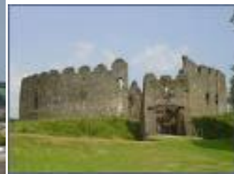
Restormel Castle – Lostwithiel

Fowey (18 miles) - Fowey (pronounced Foy) is situated on one side of the Fowey River estuary with Polruan on the other (which can be reached by passenger ferry). During high tides boat trips run from the town quay. Yachts and Dinghies crowd the estuary in the summer and from the docks, which lie upriver, China Clay is exported. There are two local festivals, the first is an arts and literature festival celebrating the life of it's most famous resident Daphne Du Maurier, which runs during May www.dumaurier.org and the second is Fowey Regatta Week which is the village carnival week and takes place at the end of August – www.foweyregatta.co.uk Upon arrival it is recommended that you park in the main car park as it can get very congested in the town, although this does mean an uphill walk when you return to your car!