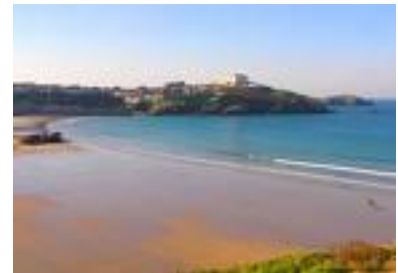
Watergate Bay – Newquay

Newquay (23 miles) - Newquay is situated on the north coast and is Cornwall's most popular resort offering large, sandy beaches and is the countries surfing capital. The town today has the reputation of being loud and commercialised due to its numerous amusement arcades, fun pubs, nightclubs and surf shops. Newquay has a Sealife Centre, Zoo, Fun Pools with flumes and boating lakes.