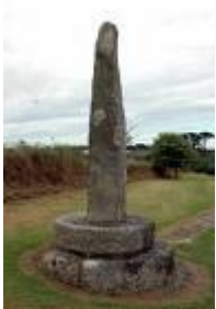
The Tristan Stone

The Hurlers, Minions - one of Cornwall's most important prehistoric sites, the Hurlers is a series of stone circles standing high on Bodmin Moor.