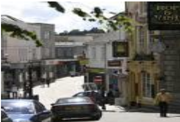
St Austell Town

St.Austell is home to the world famous Eden Project - www.edenproject.com To get there turn left out of the gate and left again at the crossroads on the main road. Upon reaching St Austell follow the brown signs.