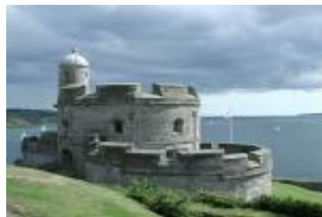
St Mawes Castle